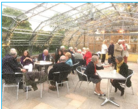
Conversation flowed, as did the wine!

Following the provided map of the Hall took the attendees to wine station 2 in the conservatory and