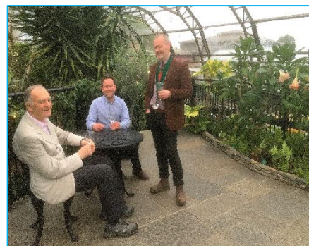
Relaxing in the Tropical House

after opening remarks from the Connetable, the champagne flutes were exchanged for normal wine glasses containing a 2021 Weissburgunder from the Pfalz region of Germany and available from M&S at £9.50. Weissburgunder is the German name for the Pinot Blanc grape and in this example, showed as an elegant wine with subtle hints of apple and almonds on the nose, while the palate showed freshness and fullness with citrus led nuances of lemon rind, grapefruit and limes. Ideal with both seafood and poultry. With the majority now happily ensconced in the conservatory the second still white of the evening was dispensed, a 2019 Lorca Fantasia Torrentes (Wine Importers {Edin} £11.75) from the Famatina Valley in La Rioja, Argentina. These grapes are grown at 900 metres above sea level and trained on the Pergola system. A greenish yellow in the glass, the nose is pronounced with jasmine and citric notes and our palates were tempted with exotic fruits, freshness and with good acidity and a satisfying long finish. For those who have never tasted Torrentes, think along the lines of floral nuanced Sauvignon Blanc. Ideal as an aperitif, or with seafood or Asian dishes and even cheese! Interestingly, with both whites having been chilled