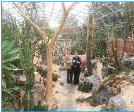
The spectacular and enticing Cactus House

Bridging the gap between white and red was a 2021 Cape Coral Rosé (Woodwinters £13.50) from Waterkloof in the Stellenbosch wine area of South Africa. Made from the Mourvèdre grape which produces some great rosé wines worldwide, this wine was pale salmon pink in the glass with aromas of peppered strawberries, tangy redcurrants and crushed wild herbs. These notes are continued onto the elegant, fine-textured palate, enlivened by crisp acidity and appealing notes of wet slate (the winemakers notes, not the writers ... honest!). The vines for this Mourvèdre grow on ocean-facing slopes with very low yields thereby concentrating the flavour. Wild-yeasts are fermented in old, large wooden vessels which they used to do once upon a time in the Mediterranean.